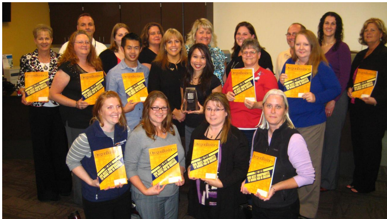
Our Providence Federal Credit Union Team!