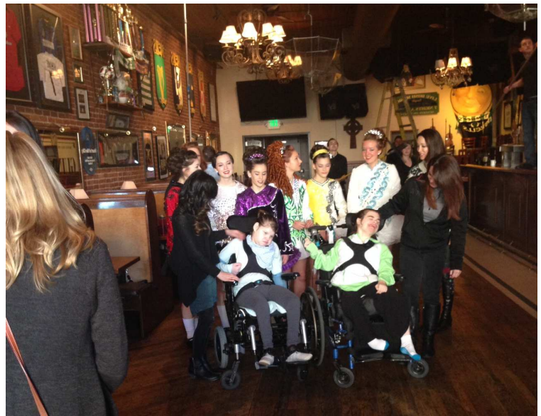
Green Rain Fundraising Event: Irish dancers with children from Providence Child Center